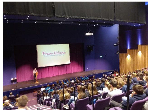
Young people from Orkney College UHI, Stromness Academy and the KGS attended an inspirational talk at the Orkney Theatre.