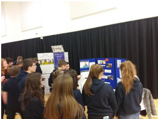
Over 250 pupils from the KGS visited the Apprenticeship Marketplace event.

Orkney College were also on hand to speak about the Foundation and Modern Apprenticeships they offer.