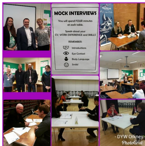
Some of the employers who supported our School Leavers' Programme.

Orkney College, the Connect Project, CITB and Voluntary Action Orkney about the support and services they provide. This helped them understand the options available to help them access further training, education or employment depending on their aspirations and abilities.